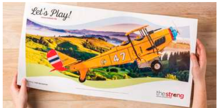
Extra-long sheet printing—maximum paper size 13 x 26" (330 x 660 mm)

It all adds up to better margins, higher profits and the ability to grow strategically with a single, future-proof investment.