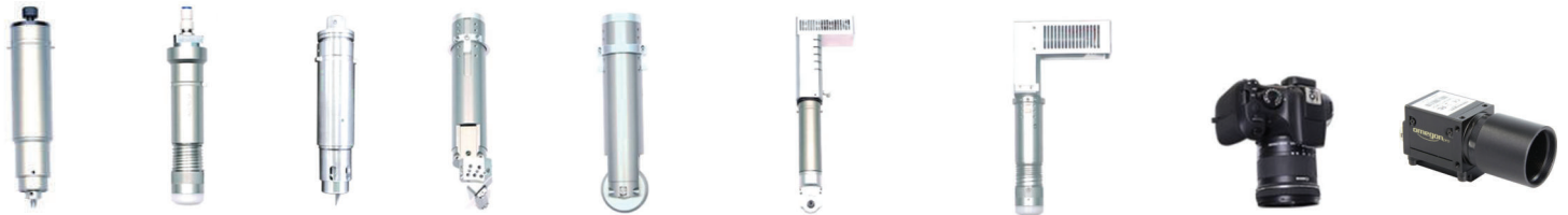
Kiss Cut Knife Tool Pneumatic Knife Tool Drag Knife Tool V-Cut Tool Creasing Tool Driven Rotary Tool High-Power Electric Oscillating Knife Tool Large Format Digital Camera CCD Camera