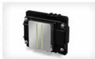
03 High resolution