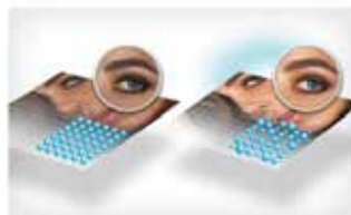
02 Support for grey-scale