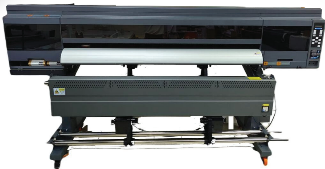
PreciousCore EPSON i3200(4)-A1