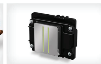
03 High resolution