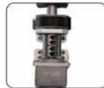
X-axis Deceleration Torque Device