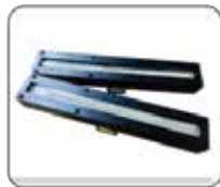
LED-UV Cold Light Source Curing Lamp