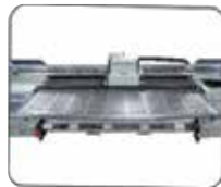
Can be equipped with front rear panel supports