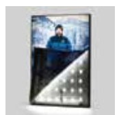
Light Box Backlit Fabric Same Color With Light Or Without Light