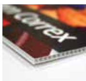
PP Foam Board