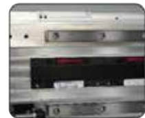
Japanese THK Double Linear Silent Guide Rail