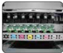
Fully Automatic Ink Path Independent Constant Temperature Control System, Monochrome Positive Pressure Cleaning Nozzle