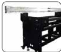
Industrial All Steel Frame Structure