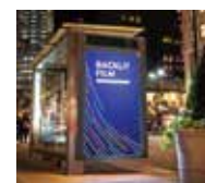
Light Box Backlit Film Same Color With Light Or Without Light