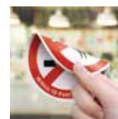
Double Sided Sticker