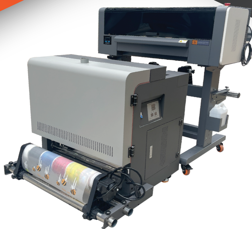
EPSON i3200-A1 PRINthead 3PCS