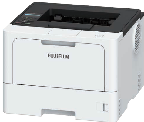
ApeosPrint 4620 SDW